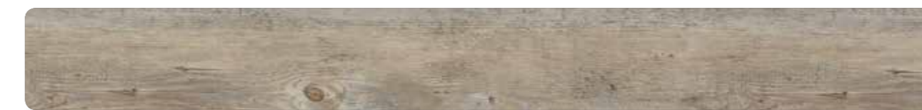
ASU1001 Washed Oak

Photographed Cover: ASU1001 Washed Oak Photographed Left: ASU1068 Spotted Gum