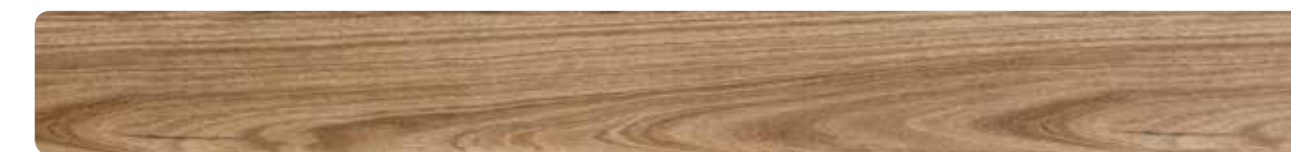
ASU1068 Spotted Gum