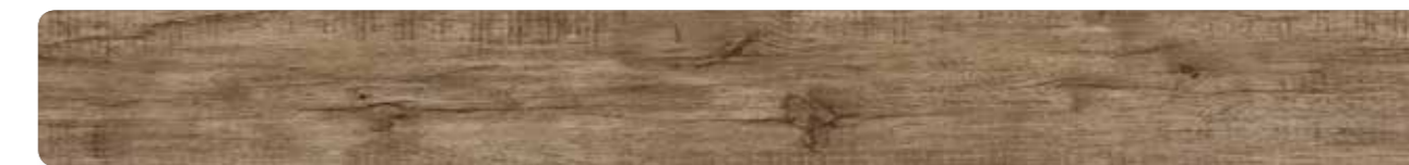
ASU1012 Squatters Gum