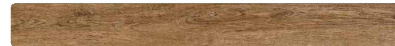
ASU1045 Select Yarri