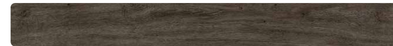
ASU1080 Chestnut Oak