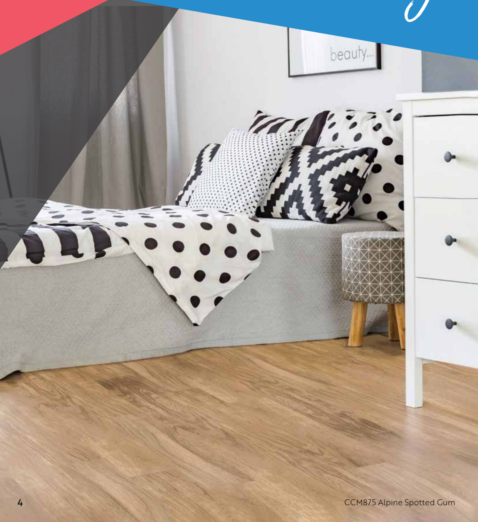
CCM875 Alpine Spotted Gum

Q uick and easy installation with 'drop down' technology requiring minimal pressure sensitive adhesive.