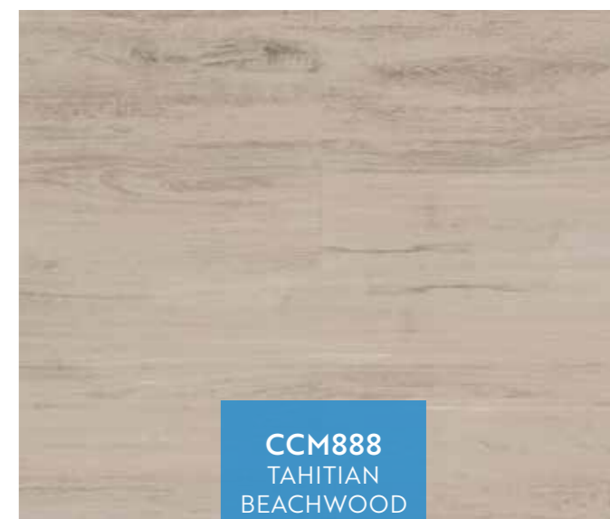
CCM888 TAHITIAN BEACHWOOD