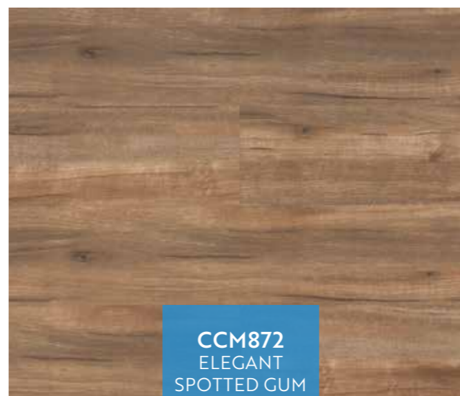
CCM872 ELEGANT SPOTTED GUM