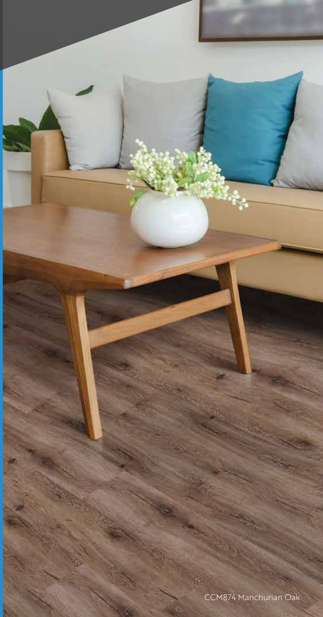
CCM874 Manchurian Oak