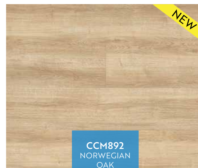
CCM892 NORWEGIAN OAK