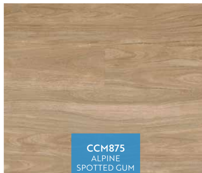
CCM875 ALPINE SPOTTED GUM