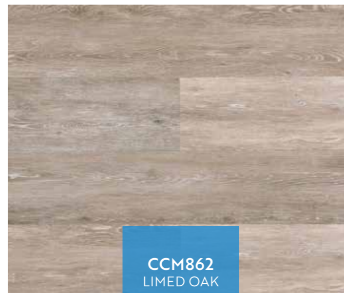
CCM862 LIMED OAK