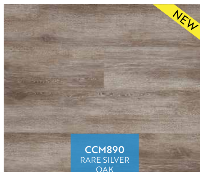
CCM890 RARE SILVER OAK