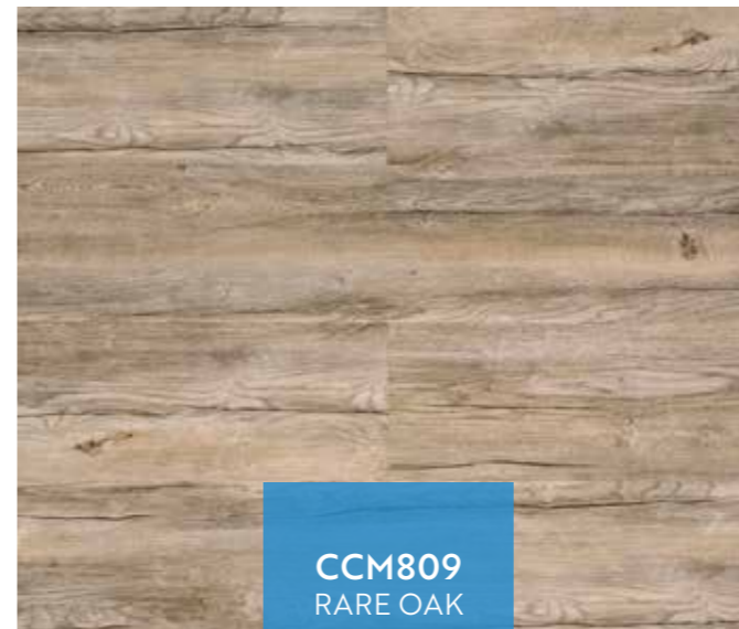
CCM809 RARE OAK