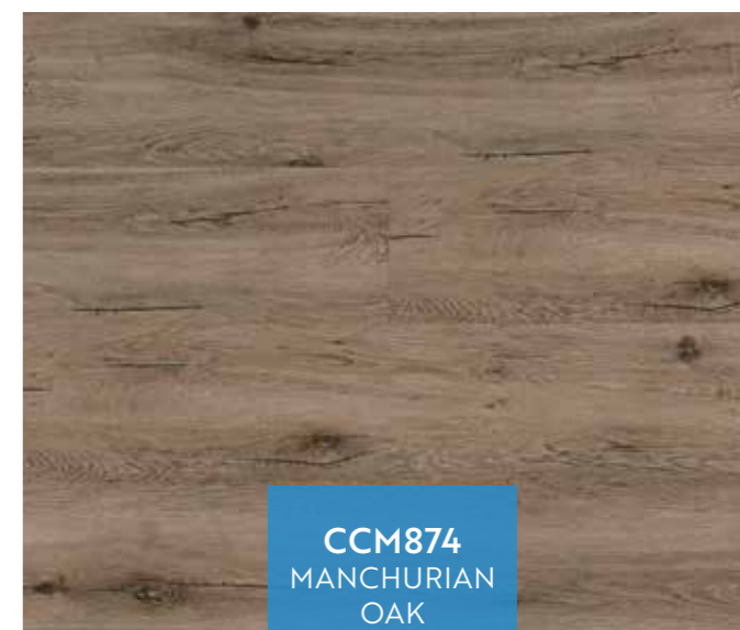
CCM874 MANCHURIAN OAK