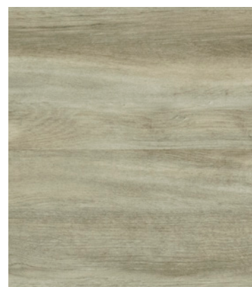
PROVINCIAL ♦ OPT1504