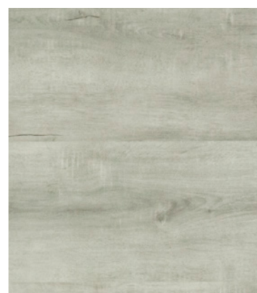
EL GRECO ♦ OPT1502