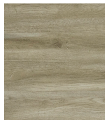
AMALFI ♦ OPT1505