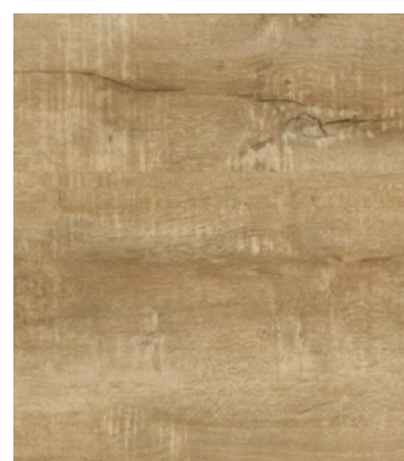
ANGELICO ♦ OPT1501

**All subfloors must be prepared in accordance with Australian Standard AS1884:201