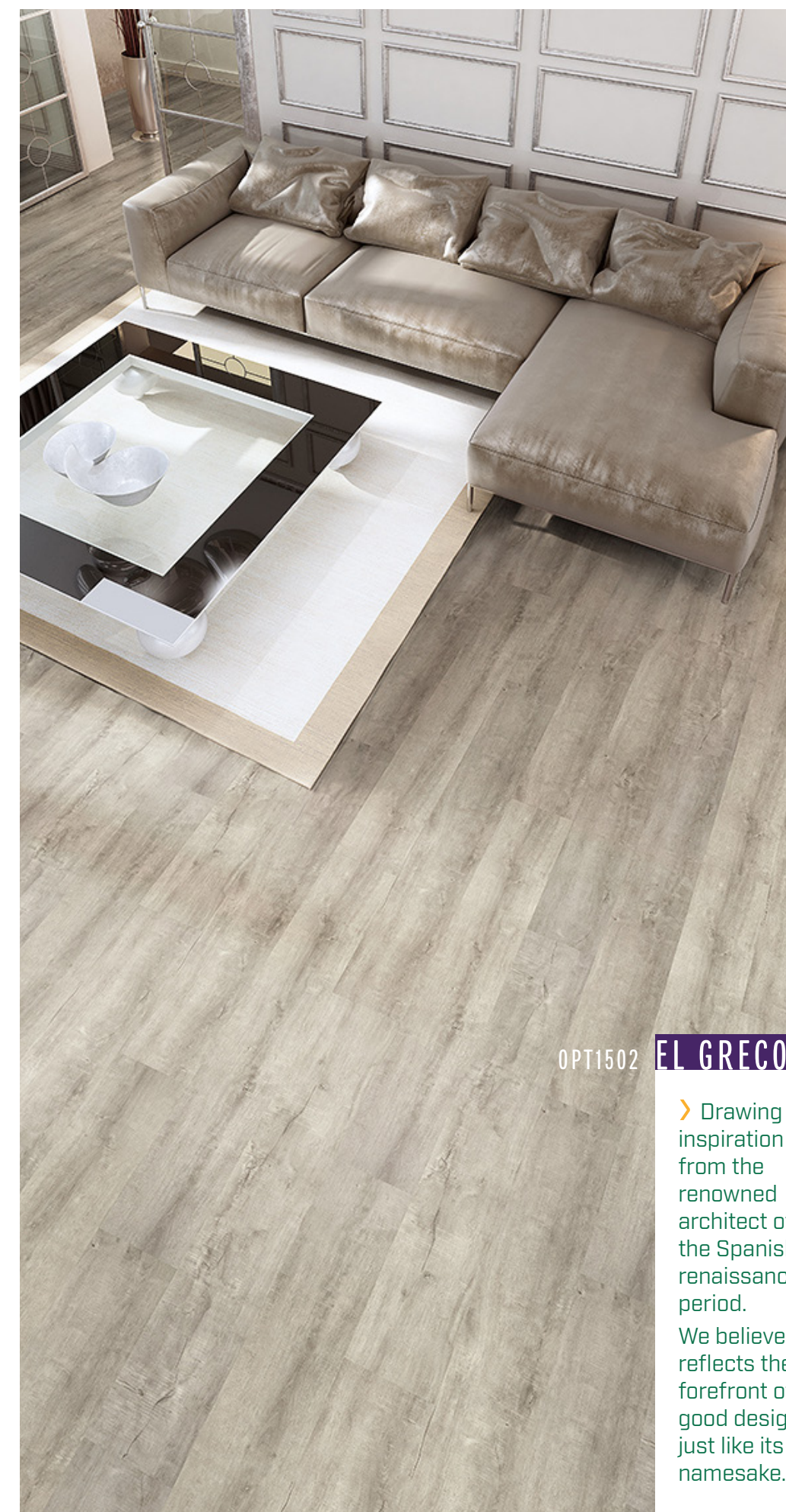
OPT1502 EL GRECO

› Drawing inspiration from the renowned architect of the Spanish renaissance period. We believe it reflects the forefront of good design, just like its namesake.