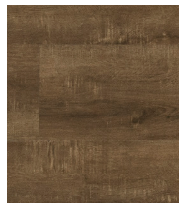
DARLINGA ♦ OPT1507