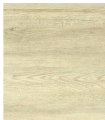
SHORESIDE OAK ♦ OPT1503