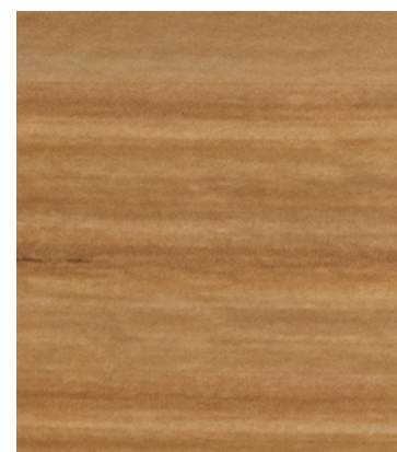
BENARKIN BLACKBUTT ♦ OPT1508