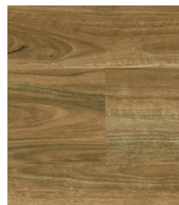
QUEENSLAND SPOTTED GUM ♦ OPT1506