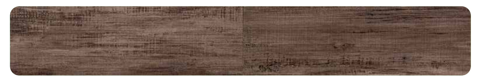
NP167HSL Hand Oiled Ash