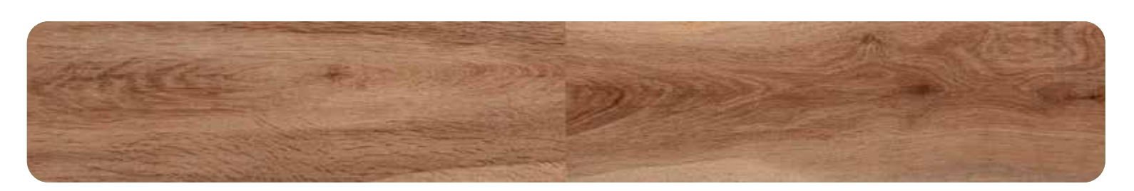
NP159HSL Rufous Oak