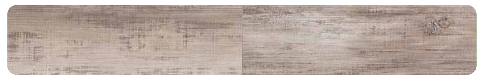
NP164TA Hand Scrubbed Silver Ash