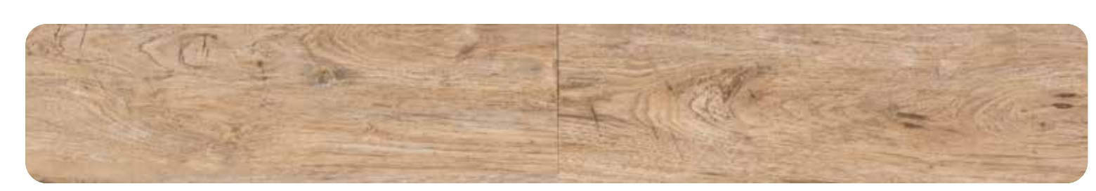
NP172HSL Alpine Kirri