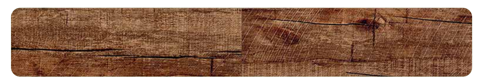
NP182RS Mallee Barnwood