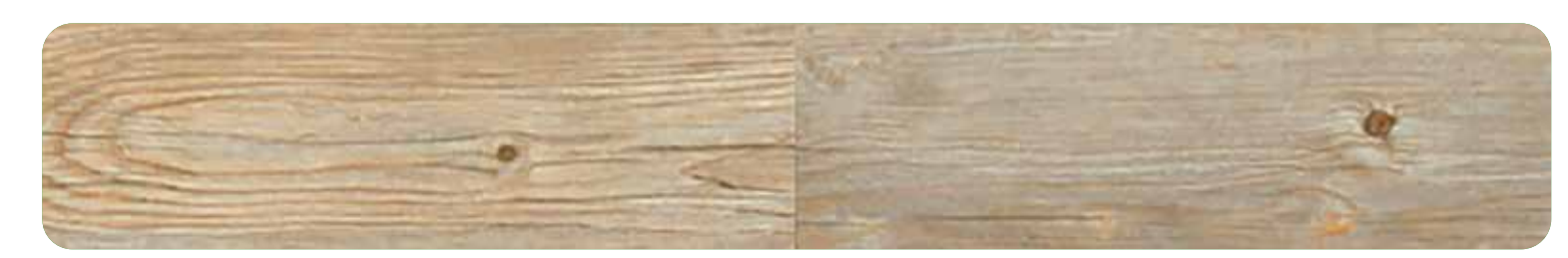
NP180TA White Hazelwood