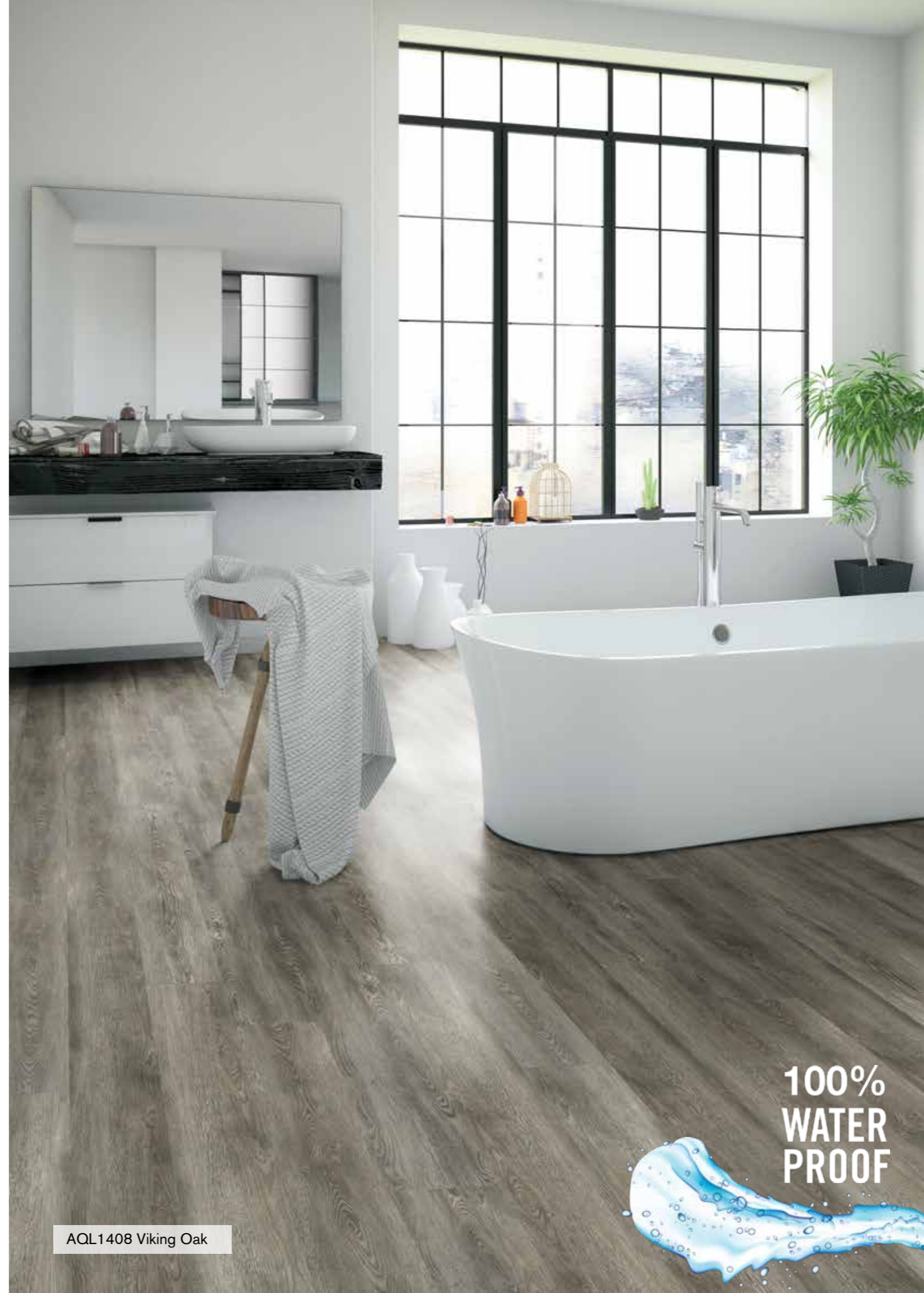
AQL1408 Viking Oak