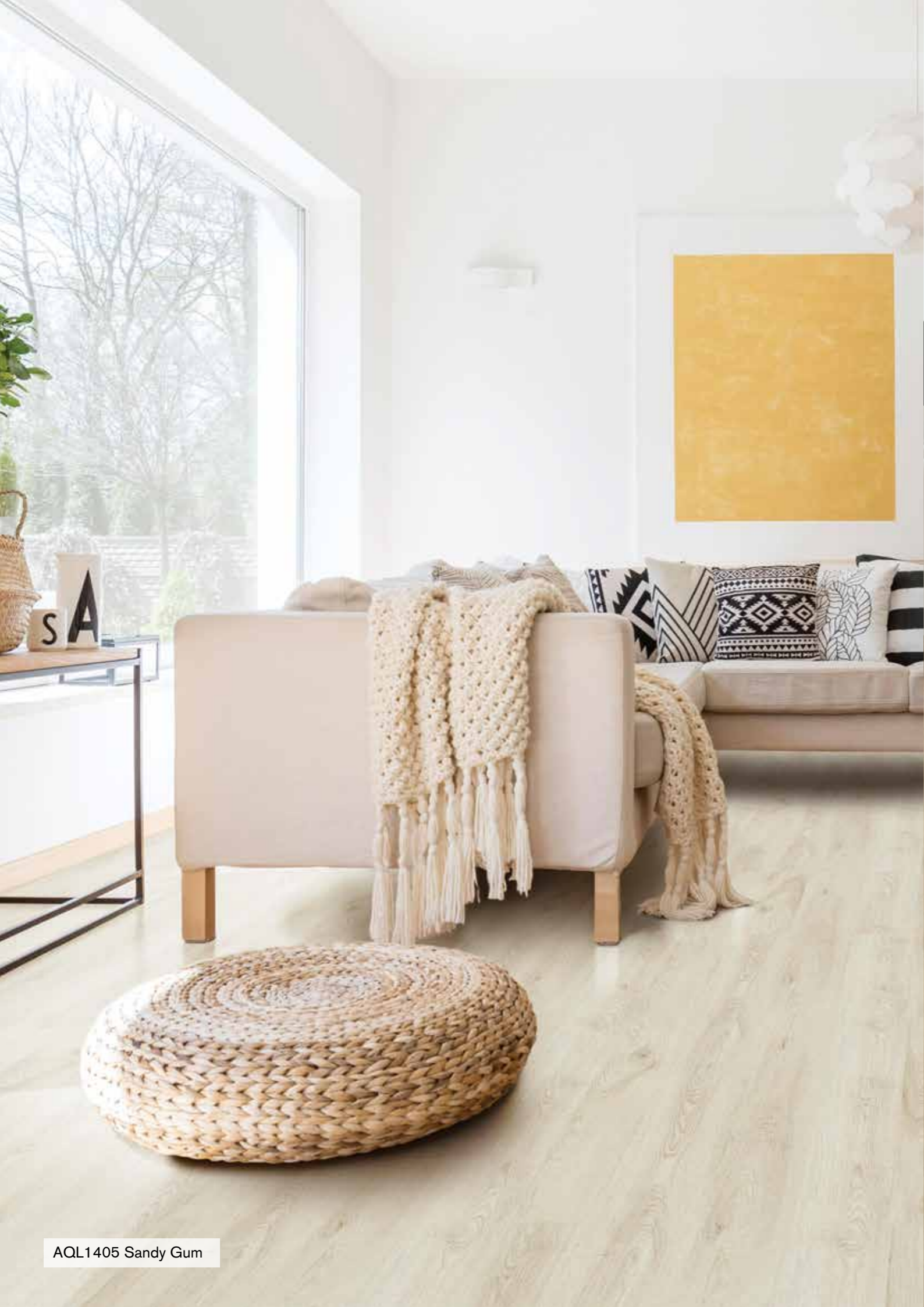
AQL1405 Sandy Gum