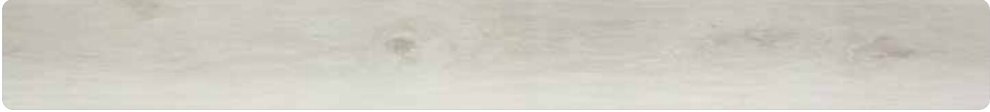
AQL1403 - Bleached Blackbutt