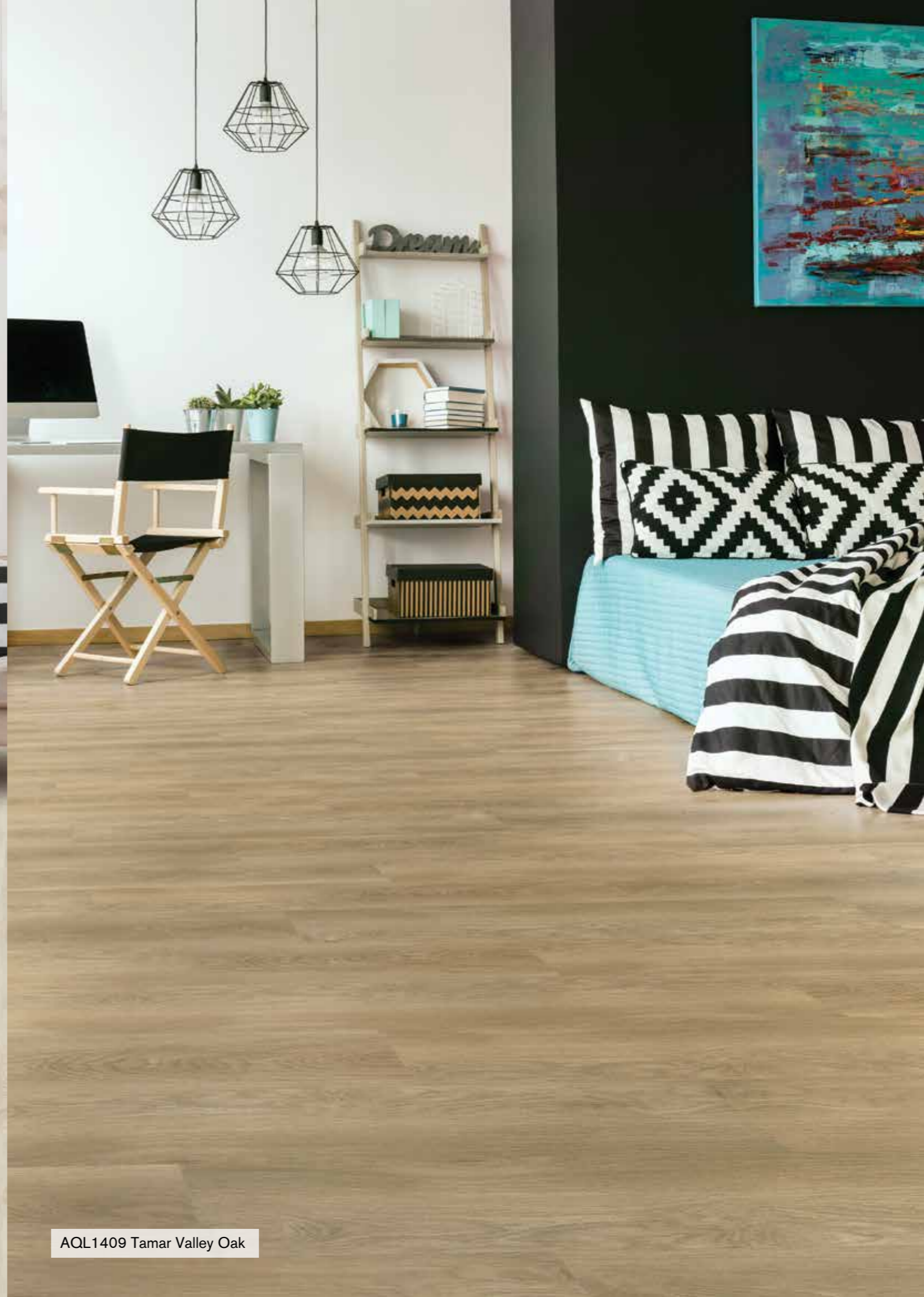
AQL1409 Tamar Valley Oak