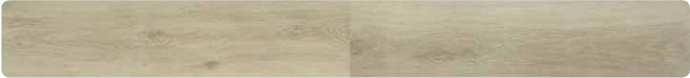
AQL1405 - Sandy Gum