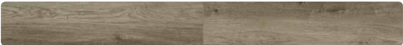
AQL1417 - Weathered Sassafras