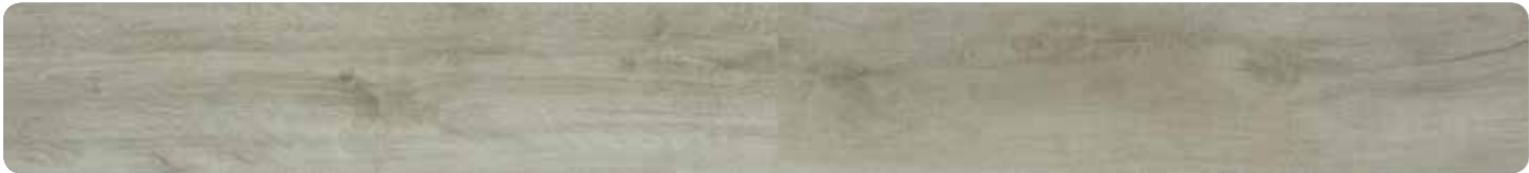
AQL1406 - Narvic Oak