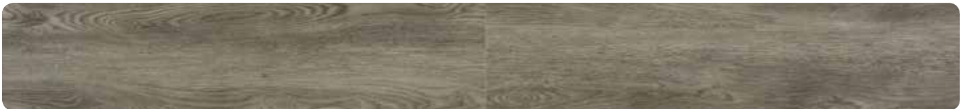
AQL1408 - Viking Oak