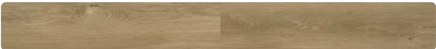
AQL1409 - Tamar Valley Oak