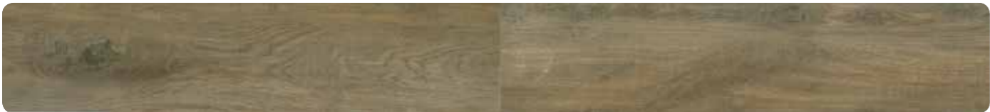
AQL1410 - Sapporo Oak