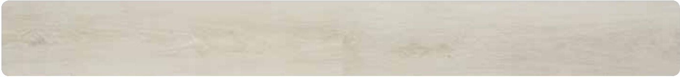
AQL1402 - River Pebble Oak