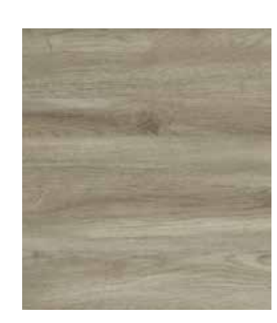
AMALFI • OPT1505