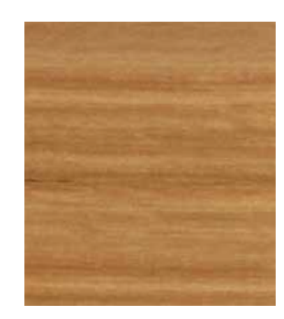
BENARKIN BLACKBUTT • OPT1508