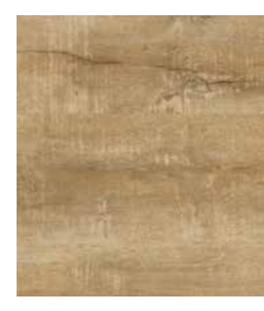
ANGELICO • OPT1501