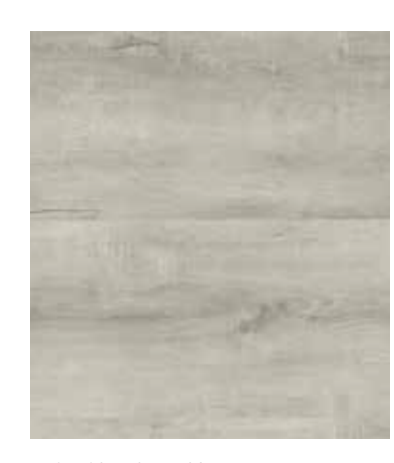
EL GRECO • OPT1502