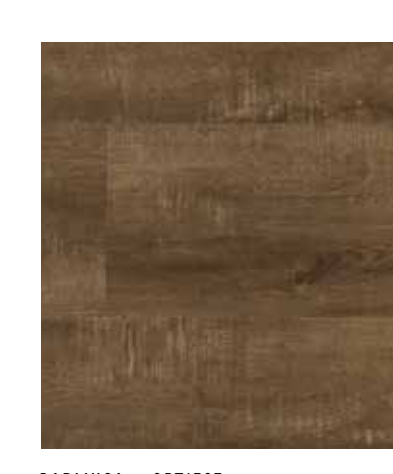
DARLINGA • OPT1507