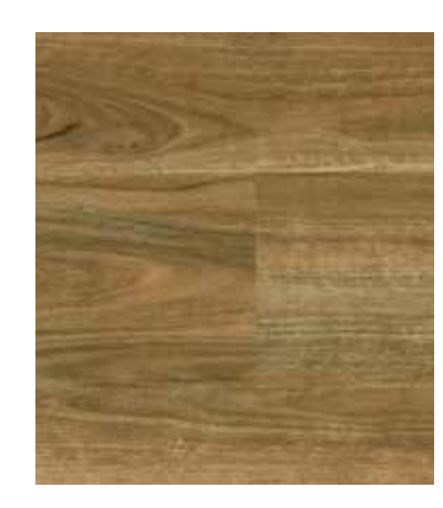
QUEENSLAND SPOTTED GUM • OPT1506