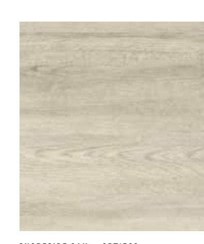
SHORESIDE OAK • OPT1503