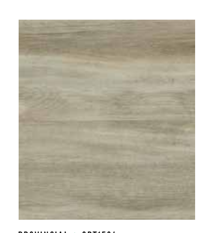
PROVINCIAL • OPT1504