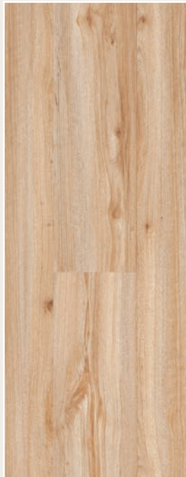
Coastal Tallowwood 1438