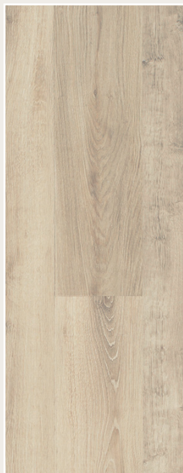
Prevalent Oak 1443