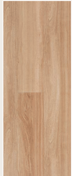
Warm Tassie Oak 1440