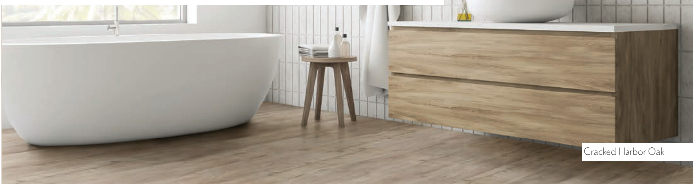
Cracked Harbor Oak