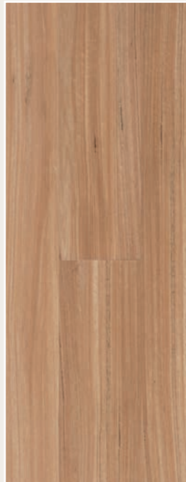
Refined Blackbutt 1439