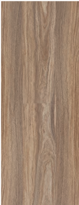
Grand Spotted Gum 1437

The range of colours, patterns and grains are drawn from both native Australian timbers and international species providing a broad selection. Whether the home is contemporary, coastal, faithfully restored or anything in-between, there will be the perfect colour and style within the range.