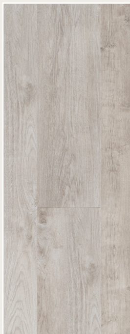
Dorian Oak 1442