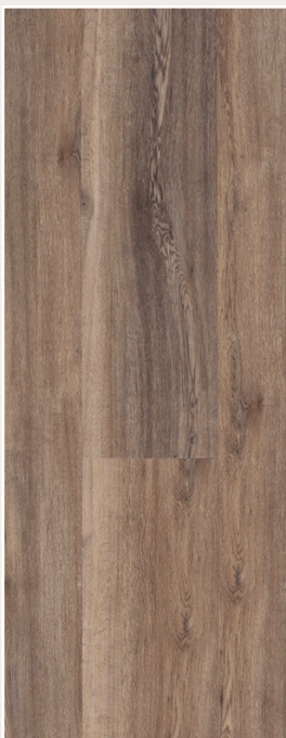
Russet Oak 1441