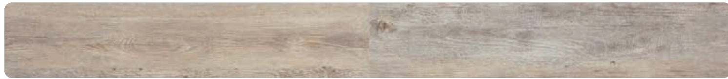
ASU1001 - Washed Oak