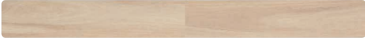
ASU1003 - Select grade Blackbutt