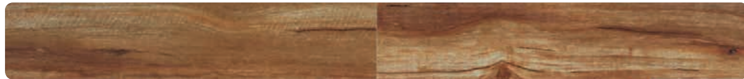
ASU1008 - Feature Jarrah