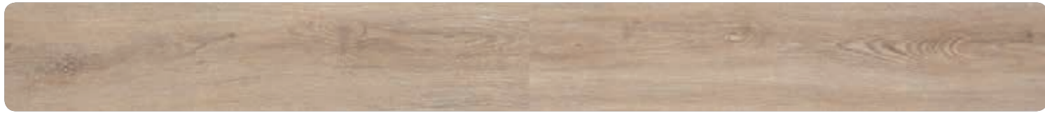
ASU1007 - Silvertop Ash