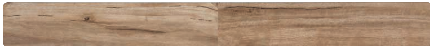
ASU1009 - Cradle Mountain Spotted Gum