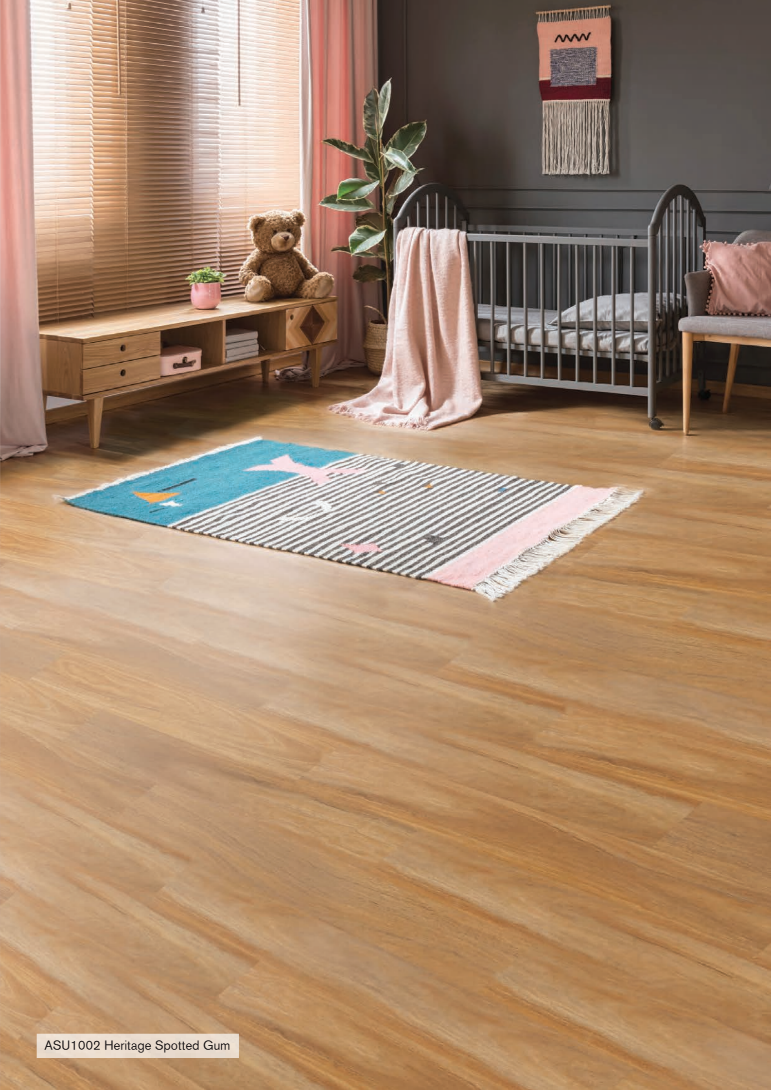
ASU1002 Heritage Spotted Gum