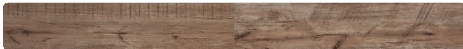
ASU1012 - Squatters Gum