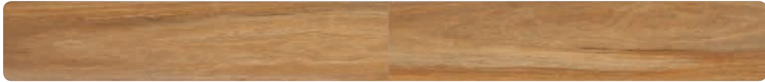
ASU1002 - Heritage Spotted Gum