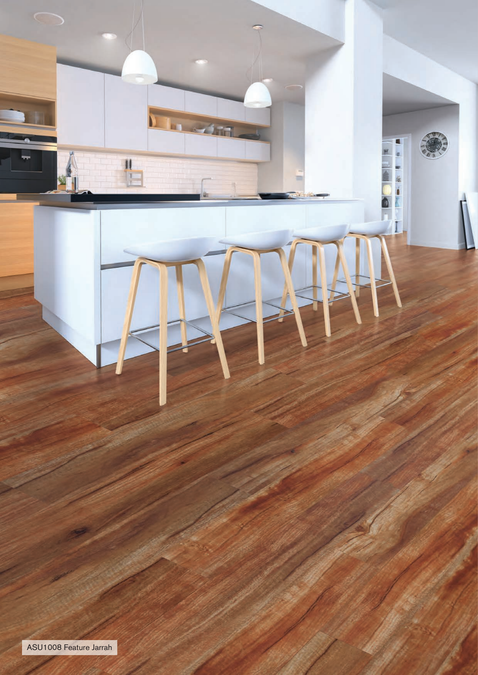
ASU1008 Feature Jarrah