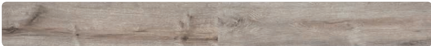
ASU1005 - Sovereign Hill