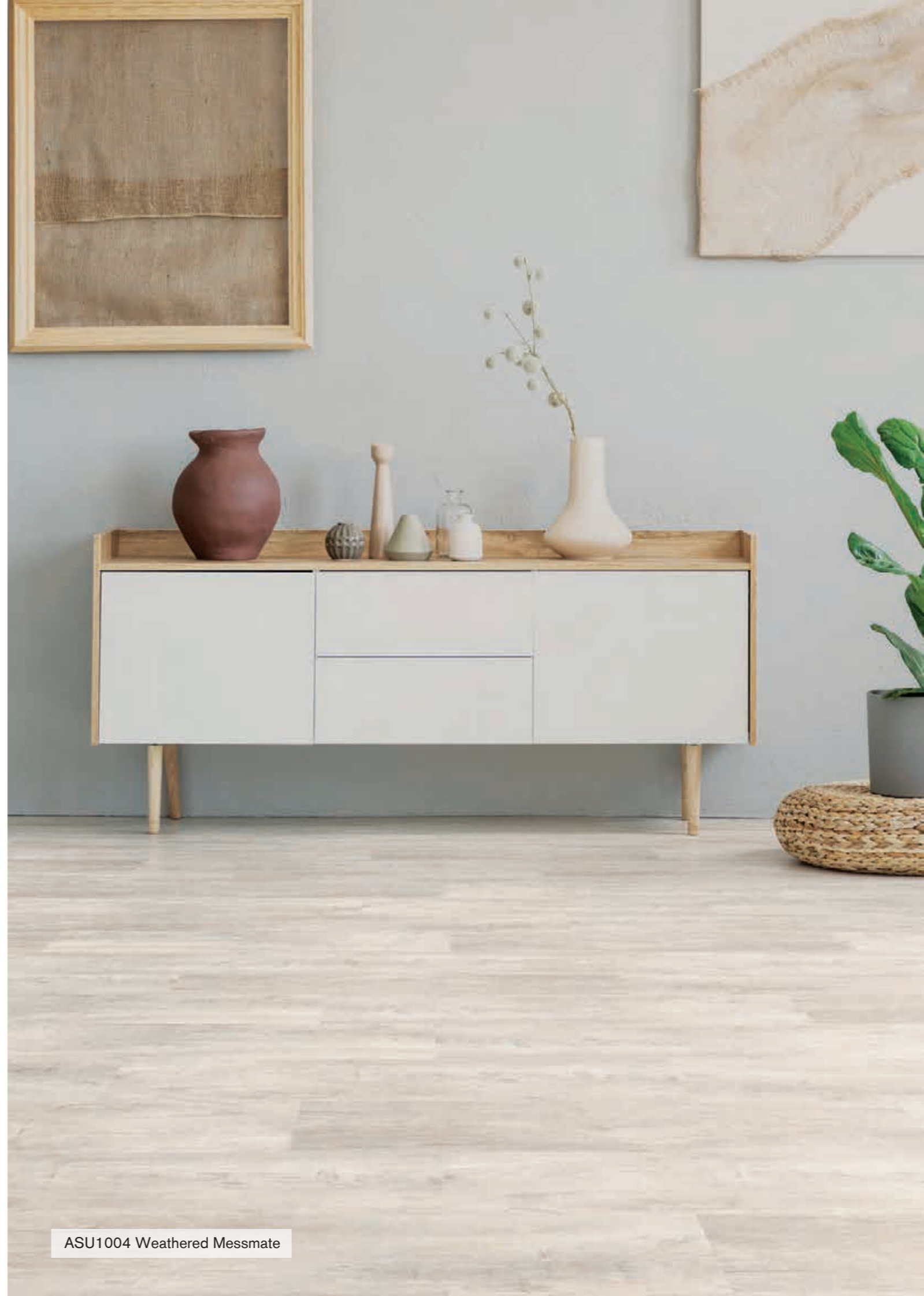
ASU1004 Weathered Messmate