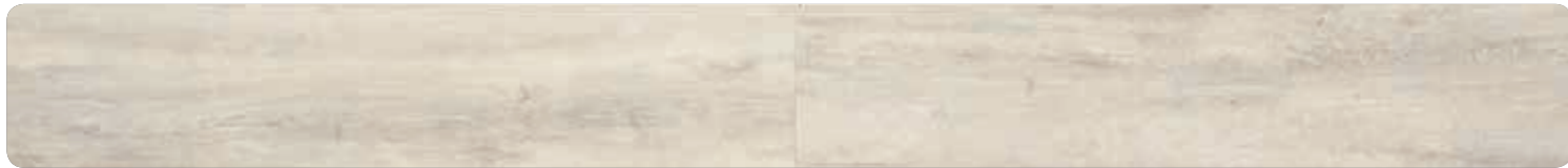
ASU1004 - Weathered Messmate