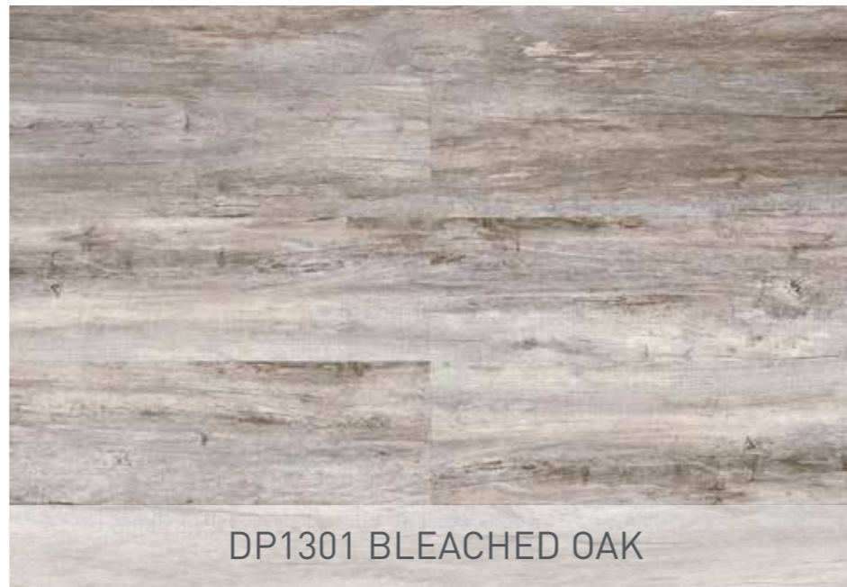
DP1301 BLEACHED OAK

With a wide colour selection from the warm tones of native Australian timbers such as Western Spotted Gum, to the cool hues of Bleached Oak. There is sure to be a colour to suit all decors.