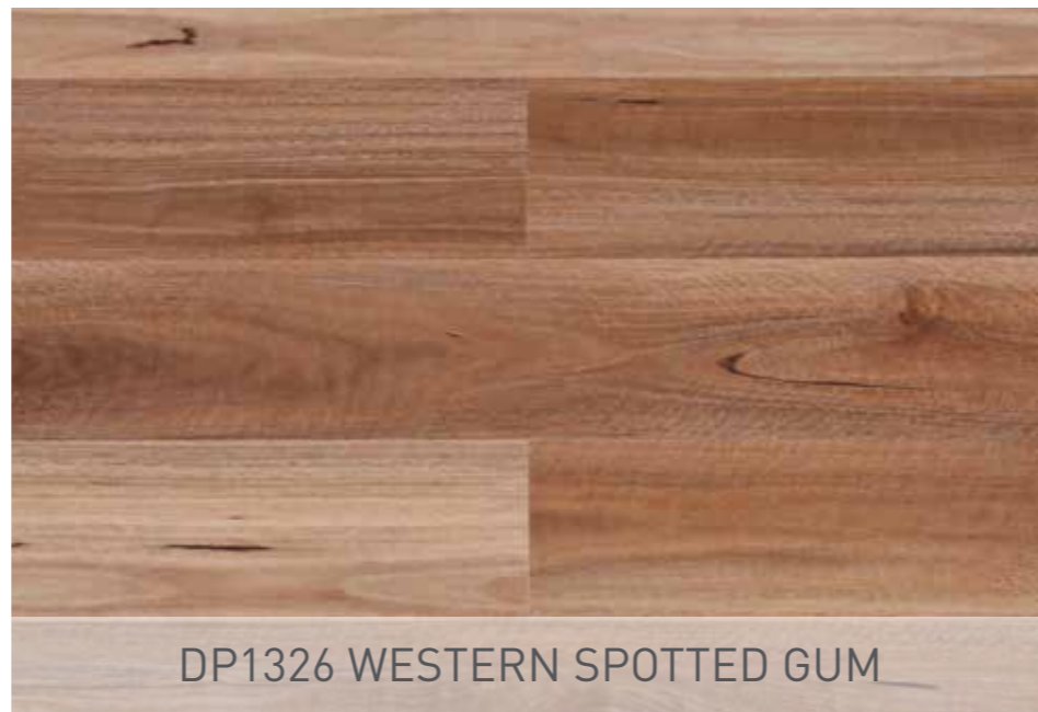
DP1326 WESTERN SPOTTED GUM