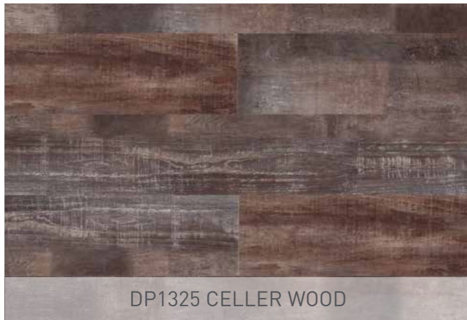
DP1325 CELLER WOOD