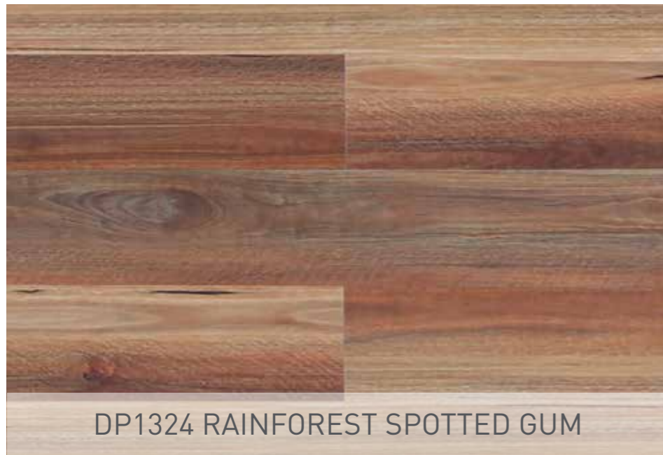
DP1324 RAINFOREST SPOTTED GUM