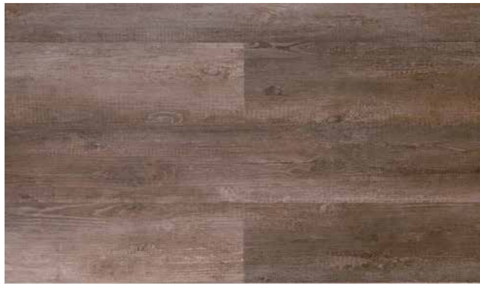
DP1318 OUTBACK STATION