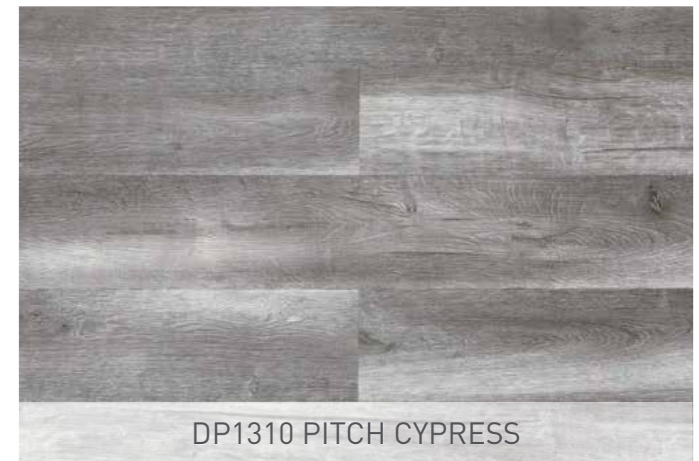
DP1310 PITCH CYPRESS