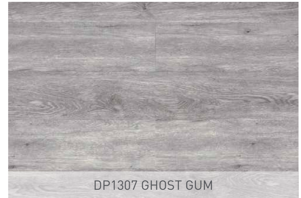
DP1307 GHOST GUM