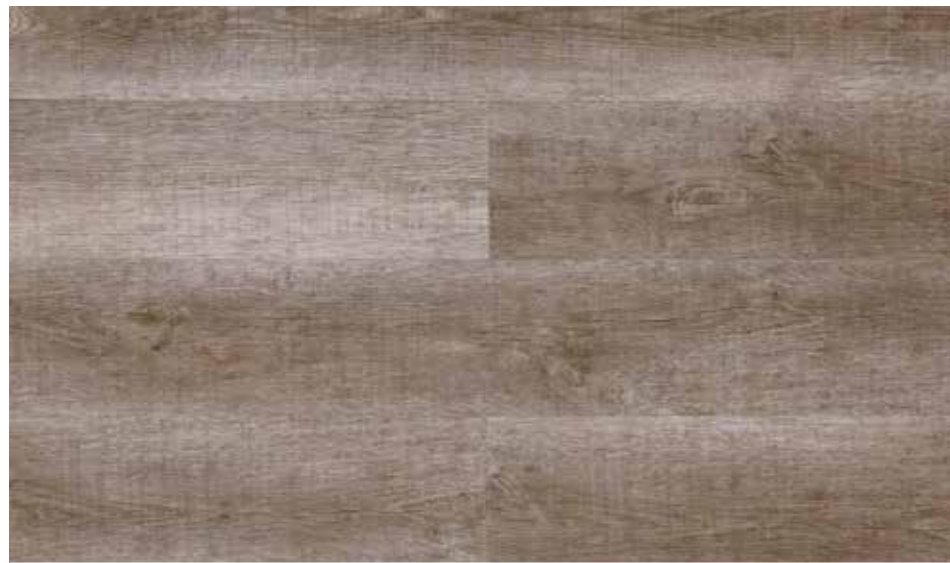
DP1315 TAUPE OAK