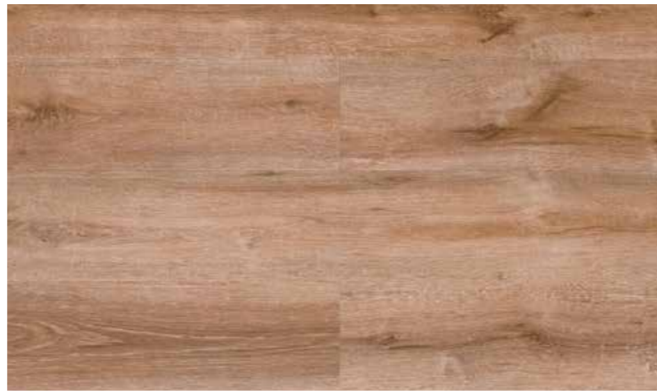
DP1312 ROYAL OAK