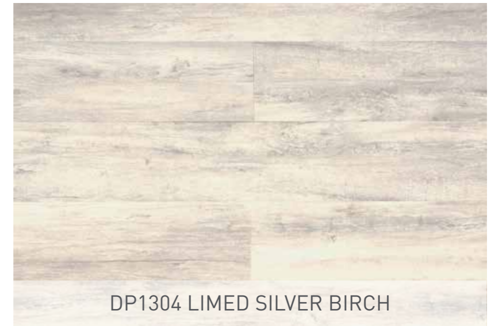
DP1304 LIMED SILVER BIRCH