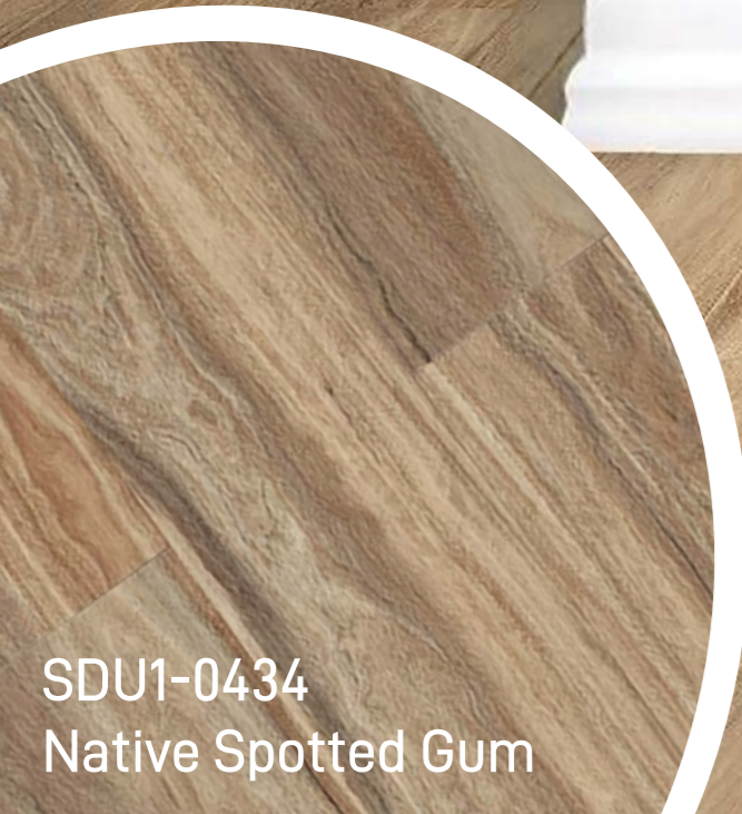
SDU1-0434 Native Spotted Gum