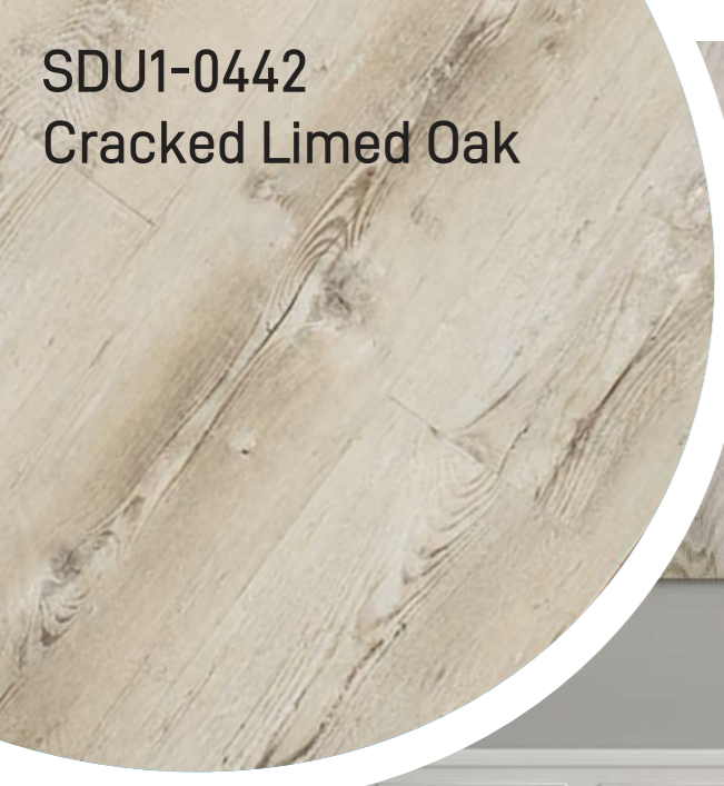
SDU1-0442 Cracked Limed Oak