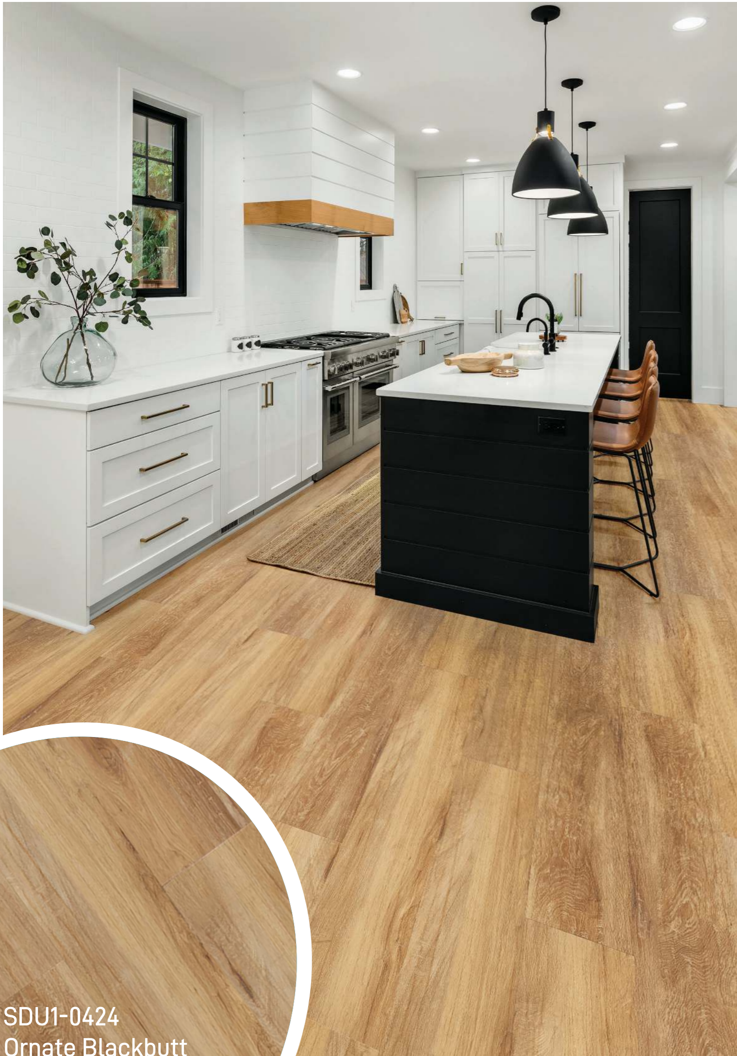
SDU1-0424 Ornate Blackbutt