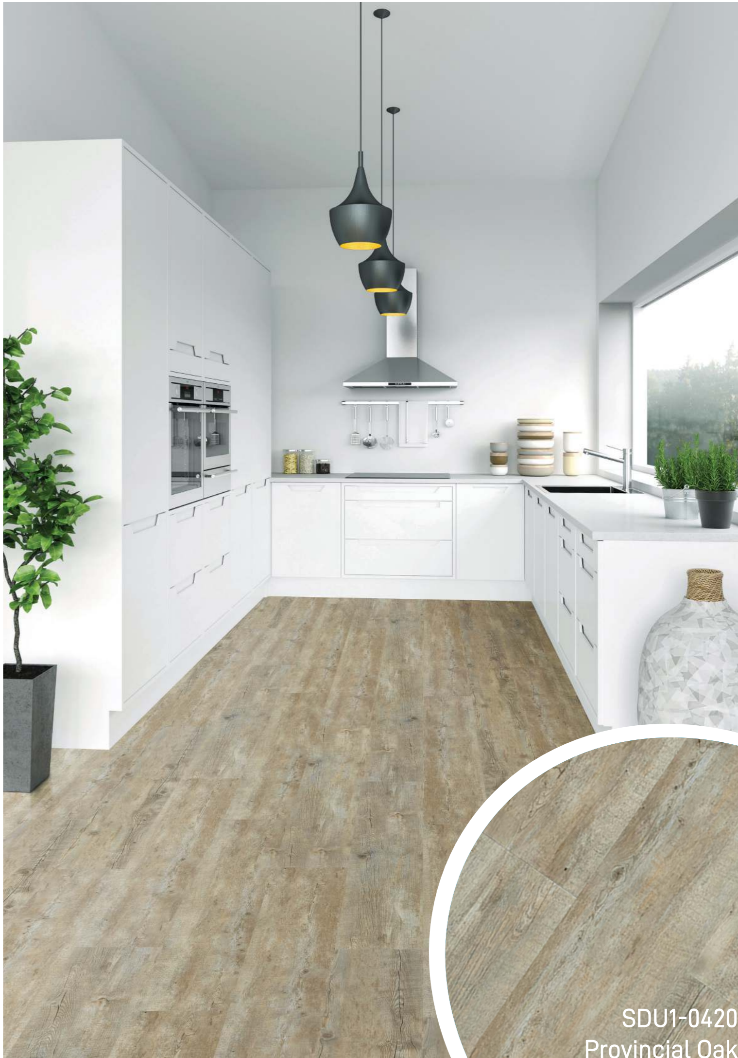
SDU1-0420 Provincial Oak