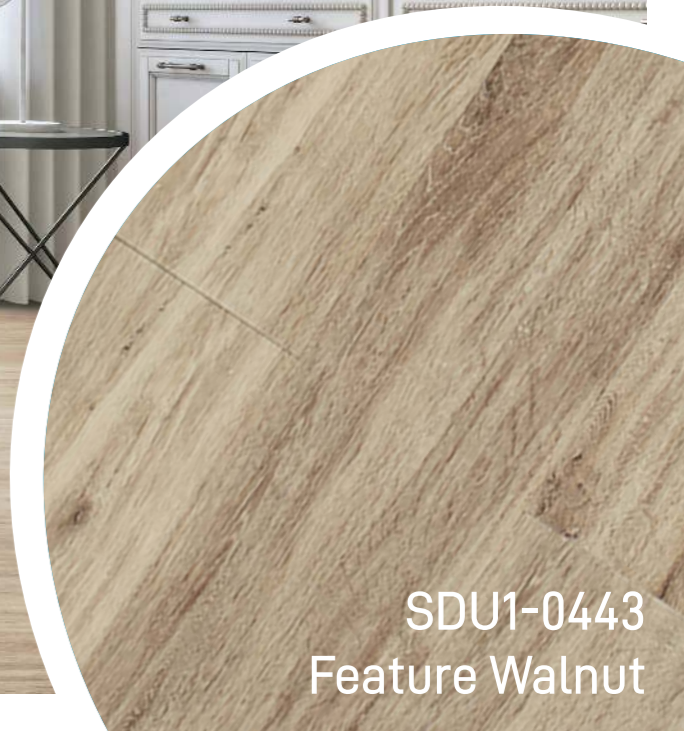
SDU1-0443 Feature Walnut