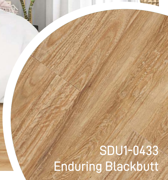
SDU1-0433 Enduring Blackbutt