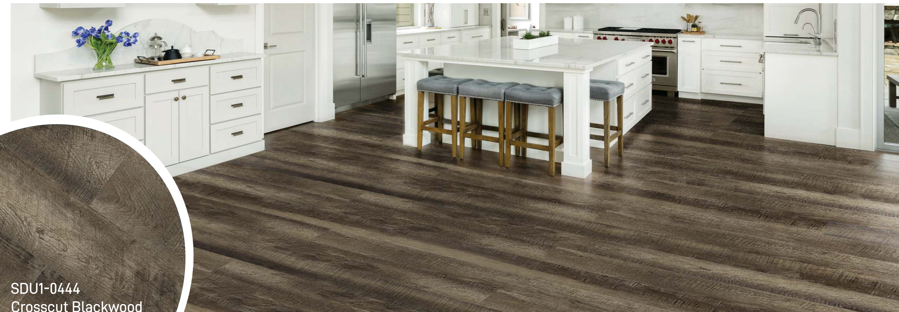
SDU1-0444 Crosscut Blackwood

Caused by excessive grit, dirt or other abrasive particles on the floor. Minor scratching may require restorative maintenance as per the above instructions. Any deep scratching or gouges in the planks will result in the individual plank/s needing to be replaced.