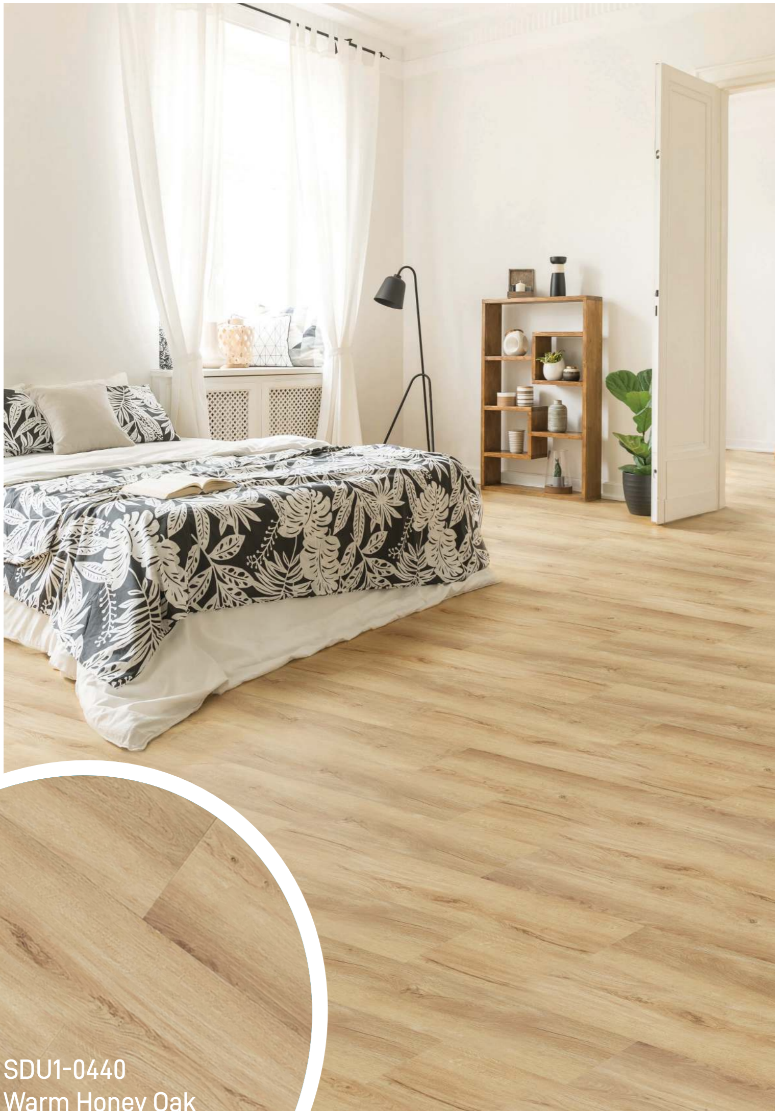
SDU1-0440 Warm Honey Oak