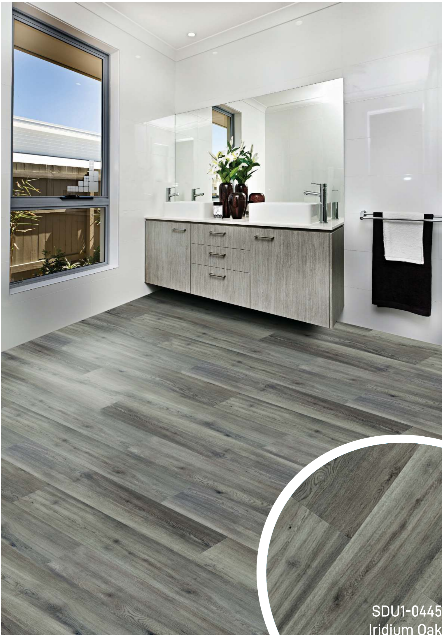
SDU1-0445 Iridium Oak