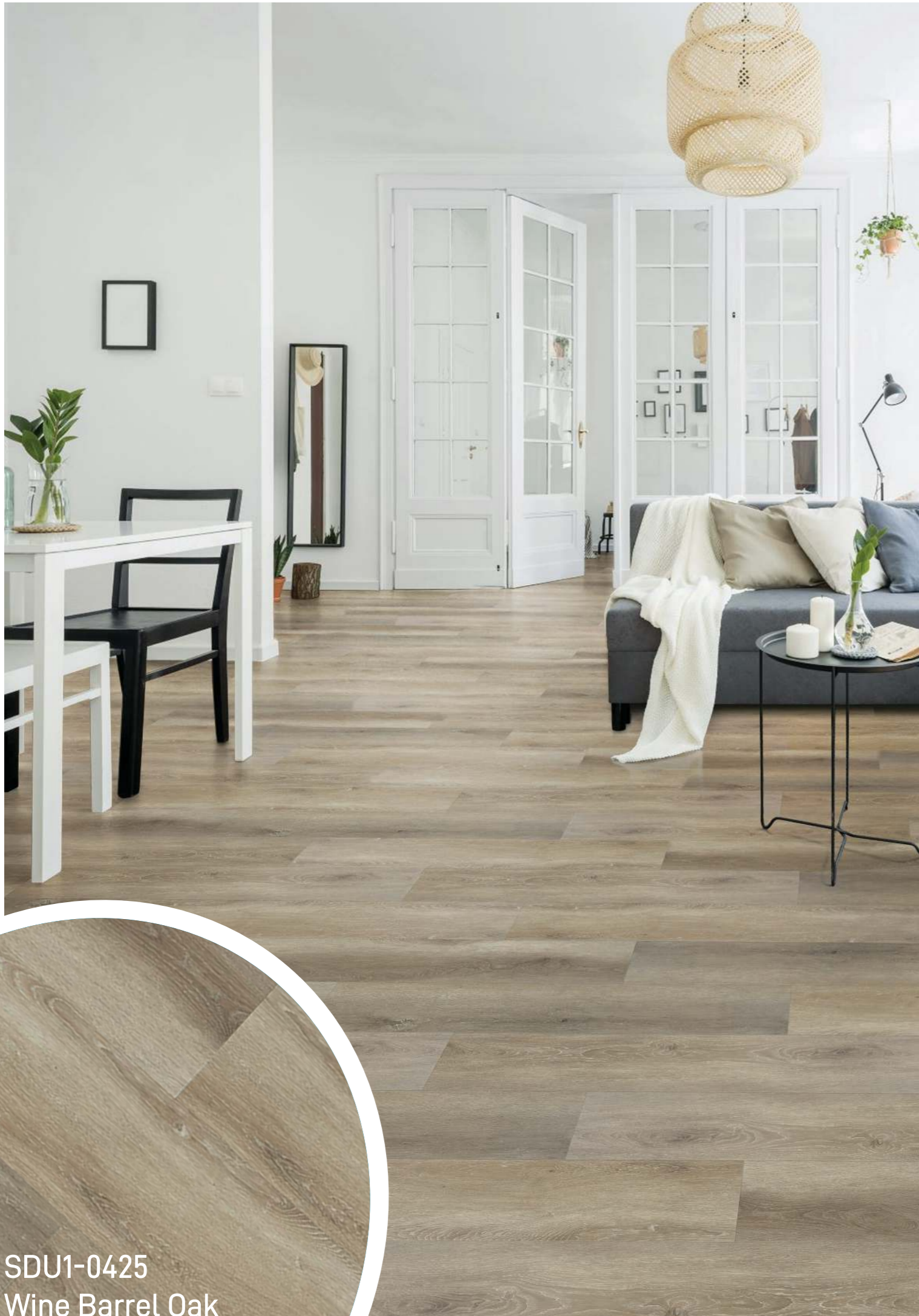
SDU1-0425 Wine Barrel Oak