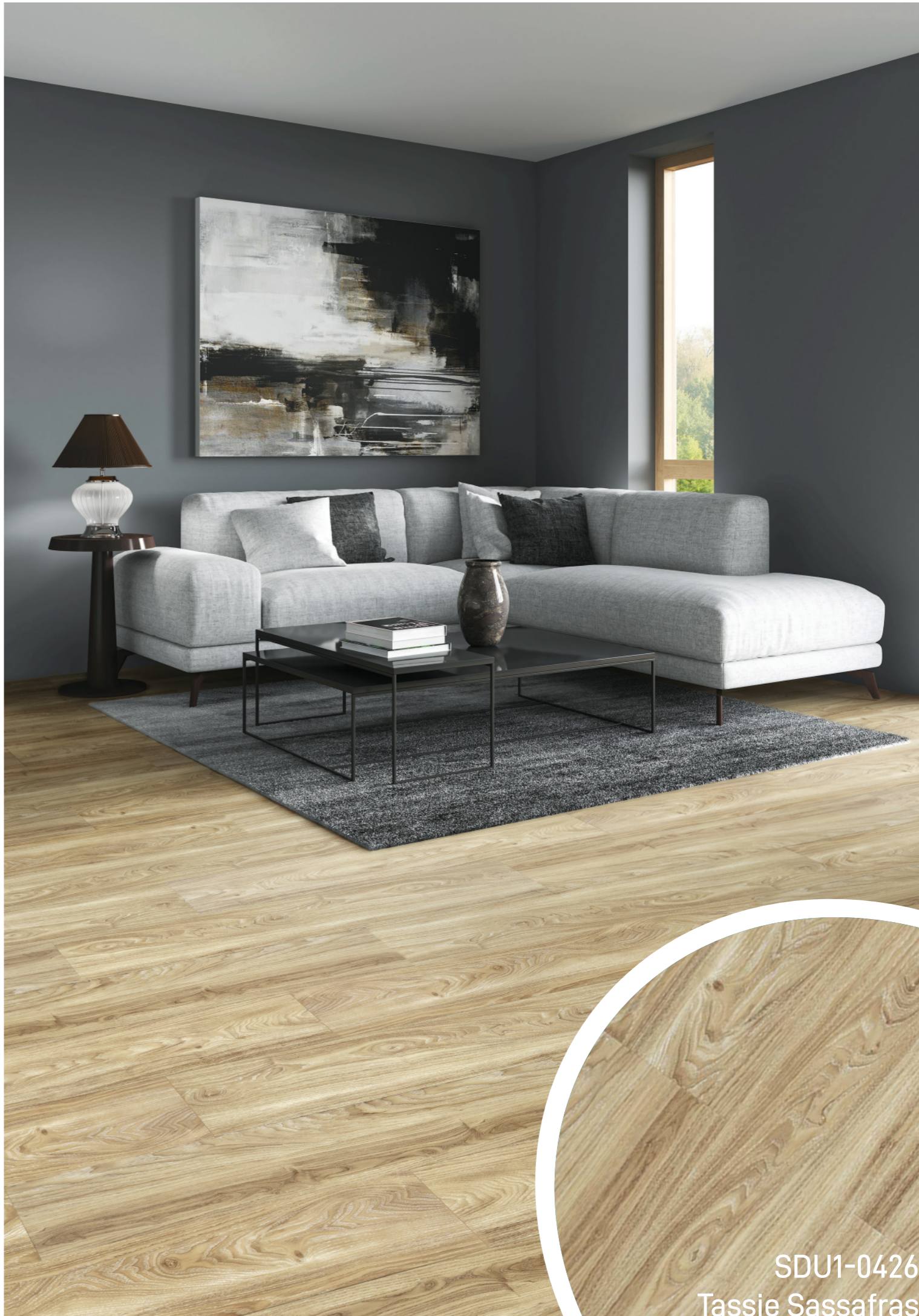
SDU1-0426 Tassie Sassafras