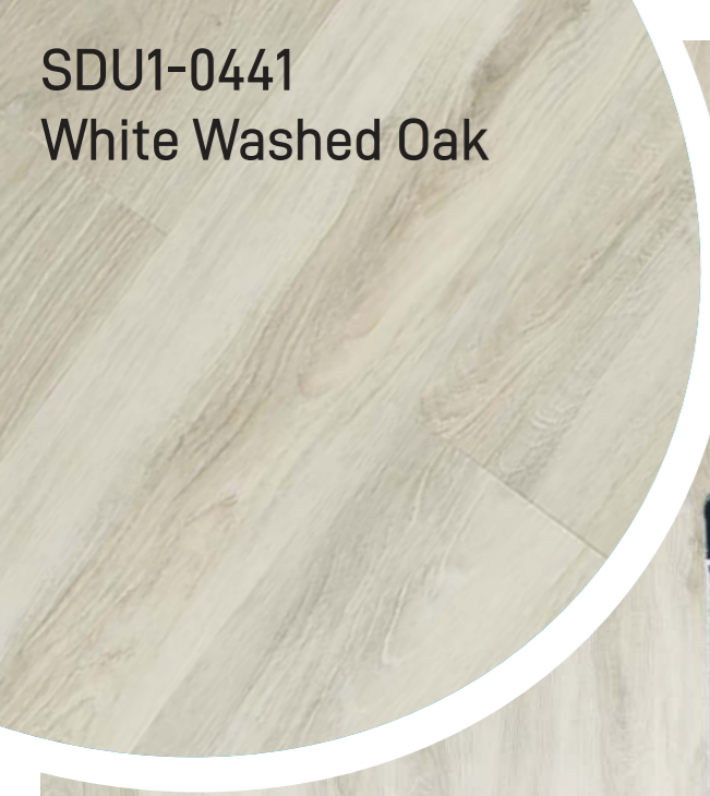
SDU1-0441 White Washed Oak