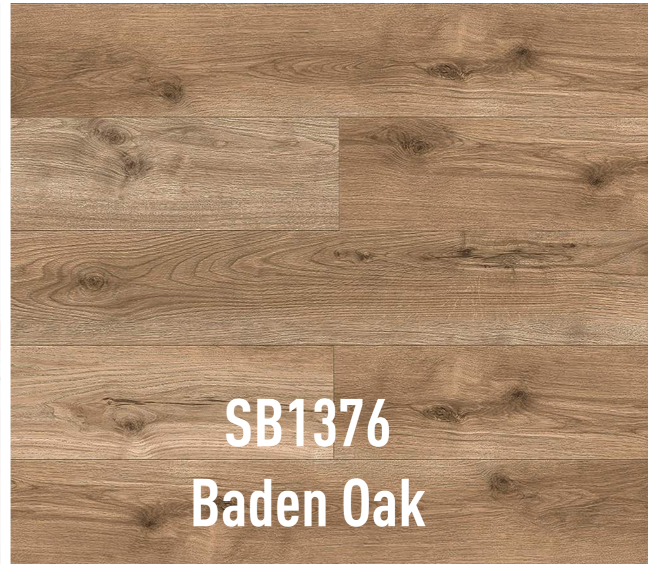
SB1376 Baden Oak