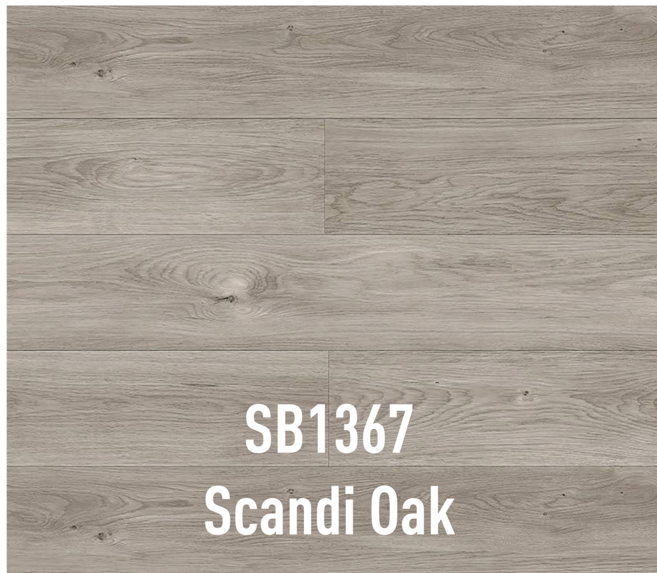
SB1367 Scandi Oak