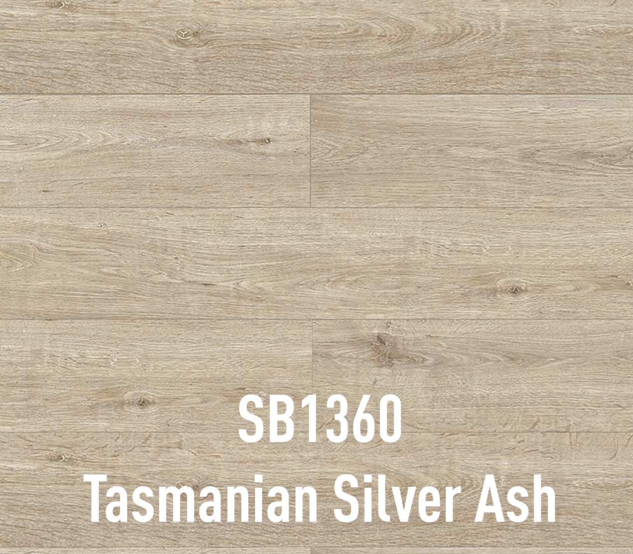
SB1360 Tasmanian Silver Ash