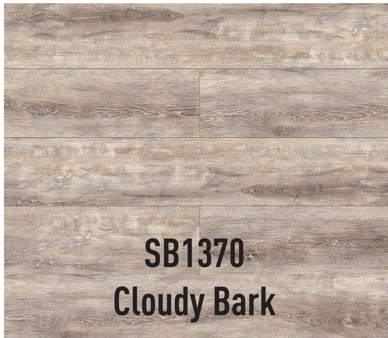
SB1370 Cloudy Bark