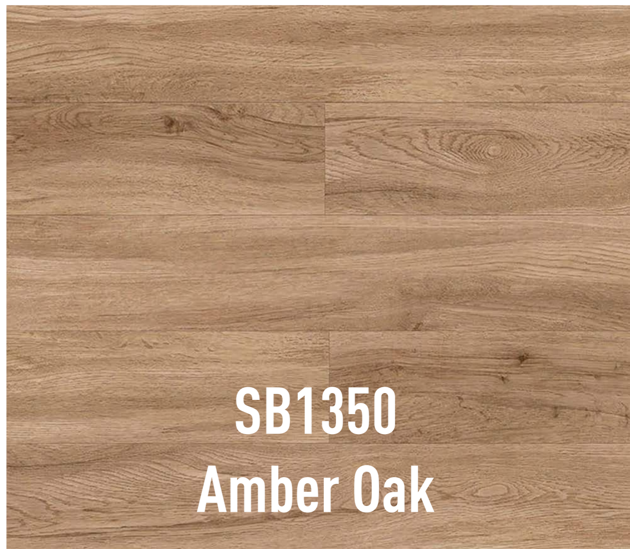
SB1350 Amber Oak