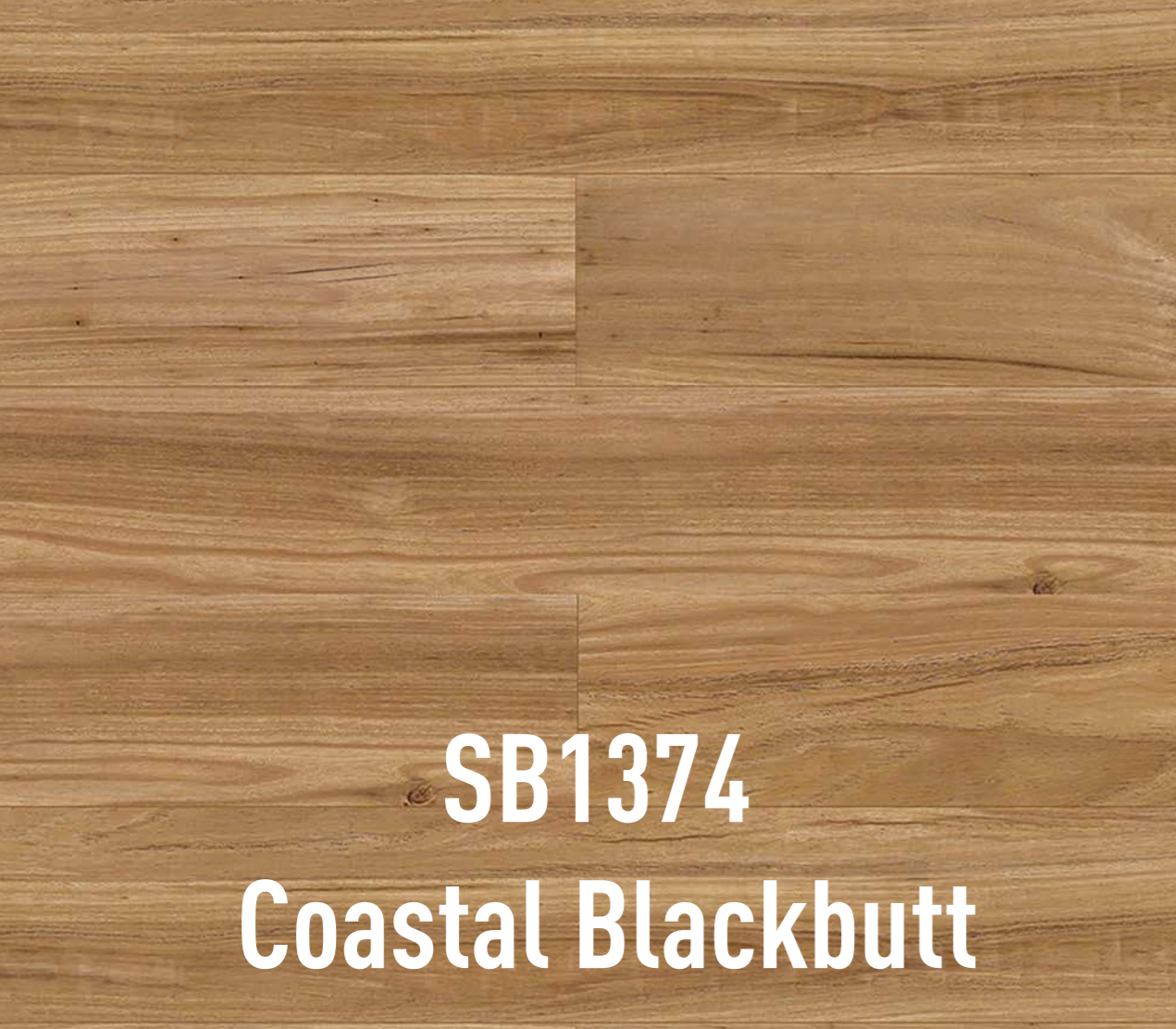
SB1374 Coastal Blackbutt