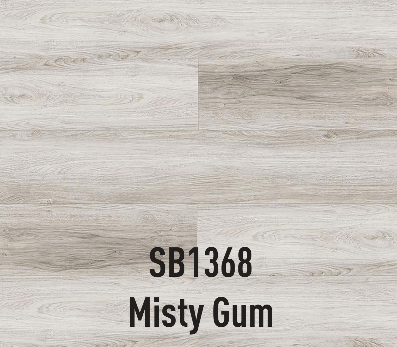
SB1368 Misty Gum