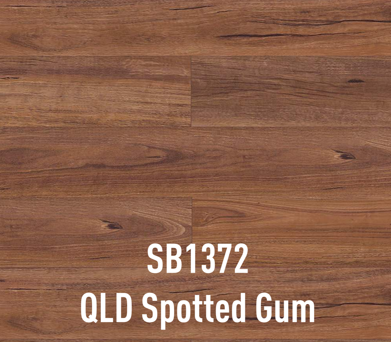
SB1372 QLD Spotted Gum