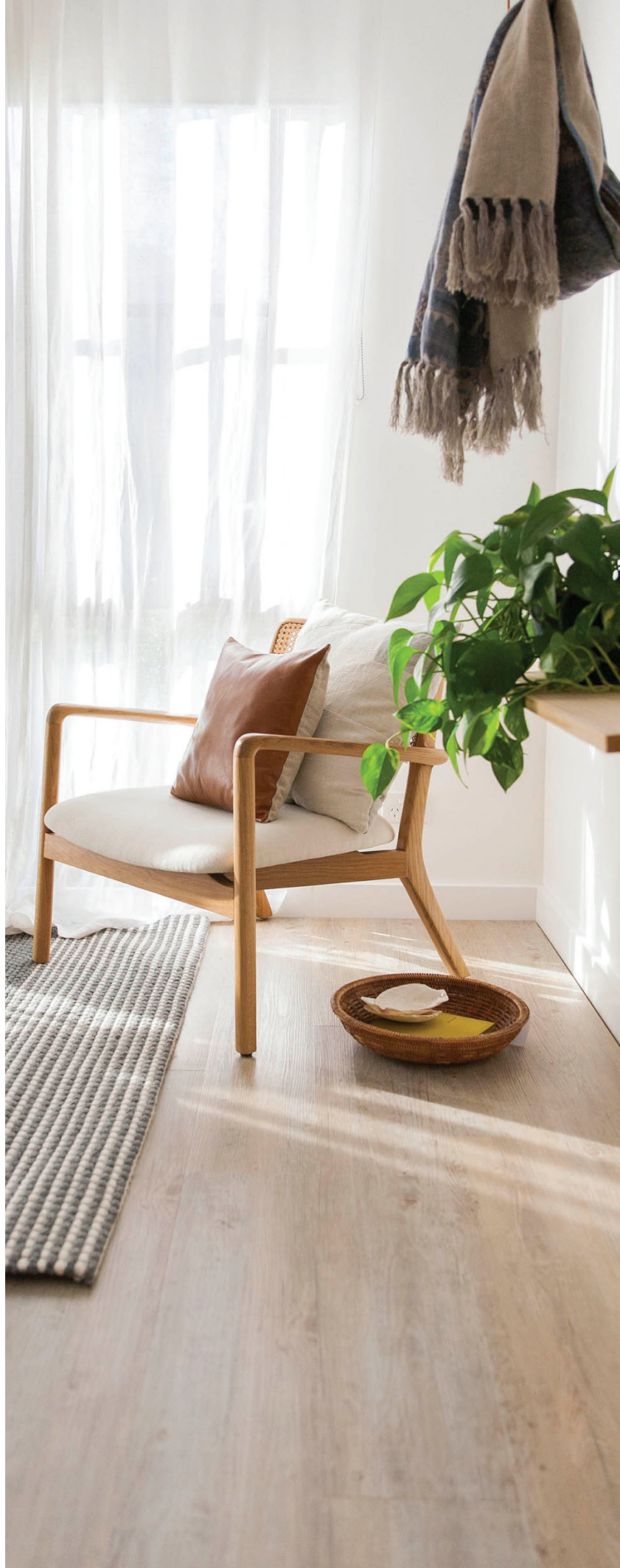
Aquasmart+ Washed Oak